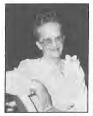
Sister Hazel Case

Psalms 116: 15 — Precious in the sight of the Lord is the death of His saints.